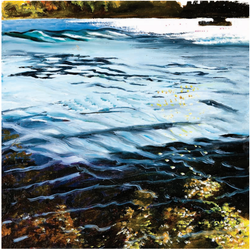
Deeper Near Shore , 2007 Oil on canvas, 12" x 12"

The painting, Deeper Near Shore , is a new addition to a series of paintings Wisseman-Widrig began several years ago, collectively called The Sea Garden , that record the play of light and reflection on the water of a tidal cove near her home. Making small-scale, on-site paintings almost daily (from which larger paintings are worked up in the studio), she adopts