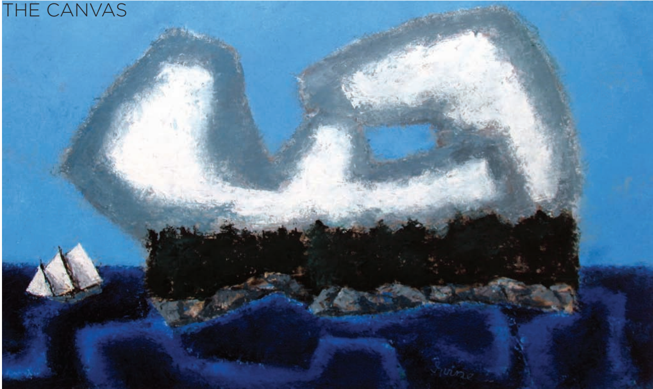
Northern Sail , 2007, 40" x 30"

Private collection, Photo courtesy Firehouse Gallery