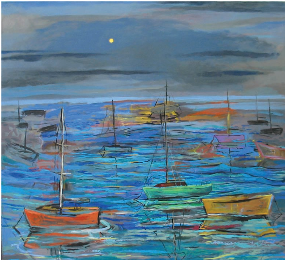
Evening Calm , 2005 Acrylic on canvas, 48" x 54"